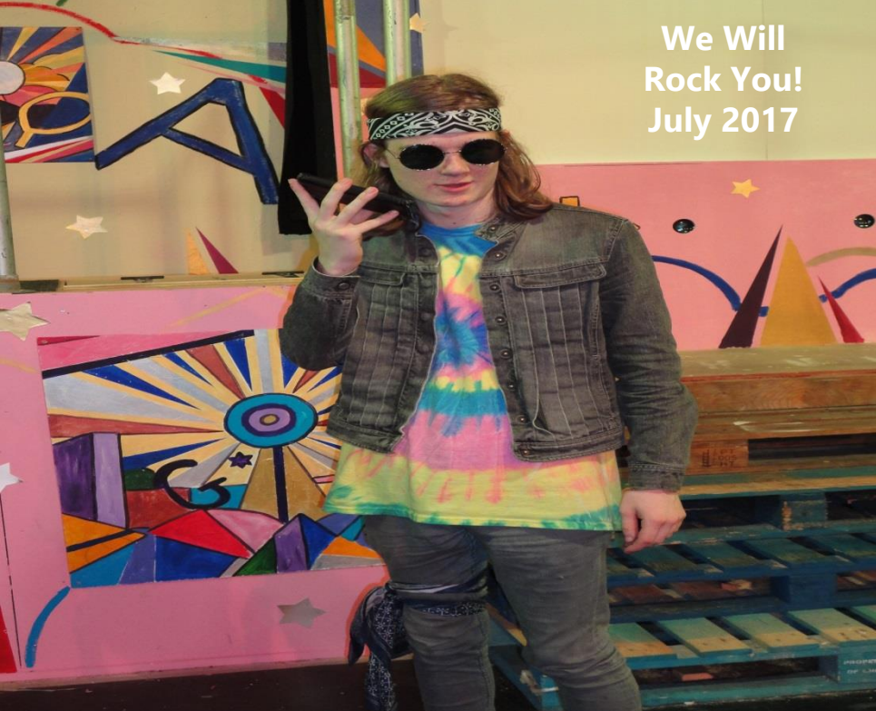
We Will Rock You! July 2017