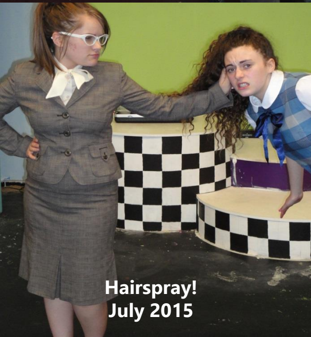
Hairspray! July 2015