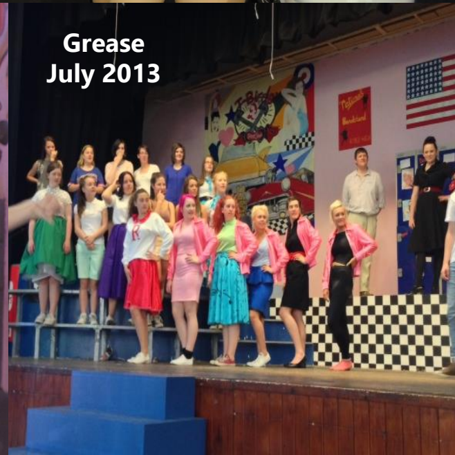
Grease July 2013